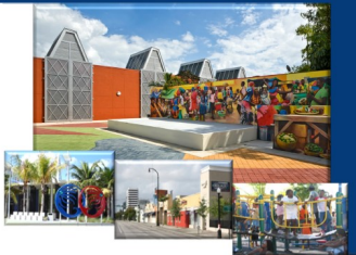
Progress and Unmet Challenges: Sant La's Profile of The Haitian Community of Miami-Dade, 2010-2015

The Commercial Industrial Association of South Florida (CIASF) contracted the Metropolitan Center to provide an objective overview of the market and explore the impact of various capital improvement and infrastructure projects on warehouse occupancy. The first major project with the potential to affect the logistics sector and industrial real estate market is the expansion of the Panama Canal due to be completed in 2016. The Metropolitan Center designed a scope of services for the research and analysis of the impact of these projects on the logistics sector and commercial real estate market.